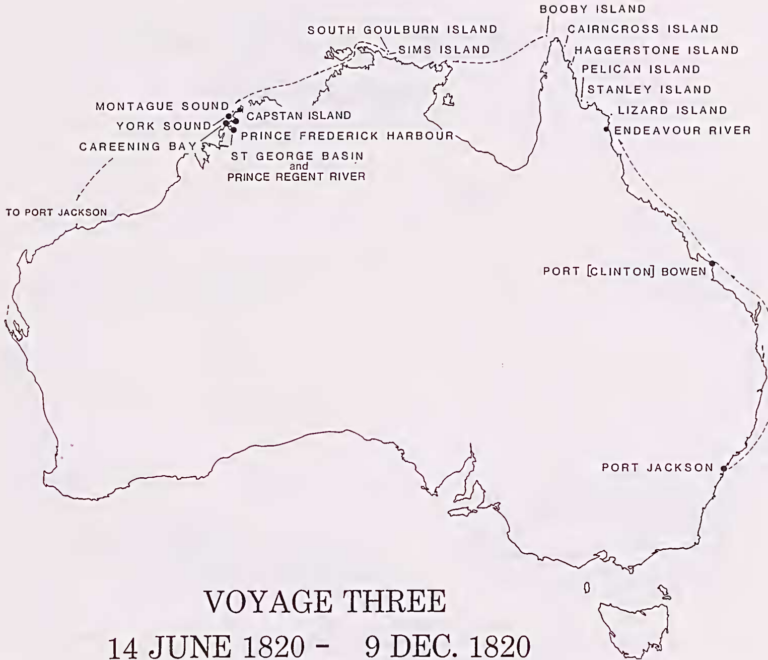
Fig. 3. Route map of Voyage 3.